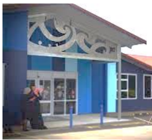
Please ONLY go to our School Office

Both of these things are not just a rule we made up for ourselves, they are the law . Set out in Public Health Orders, MOE regulations and MOE directions to schools.